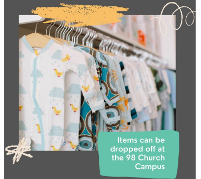
LAYETTES COLLECTING NEW OR GENTLY USED PREEMIE AND 0-3 SIZED SLEEPERS, ONESIES, HATS, BIBS, SOCKS, BLANKETS, OR MONEY FOR PURCHASING SUPPLIES.